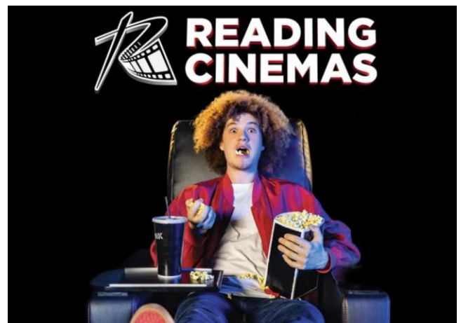
Readings at Busselton Central December Sales 42% up.