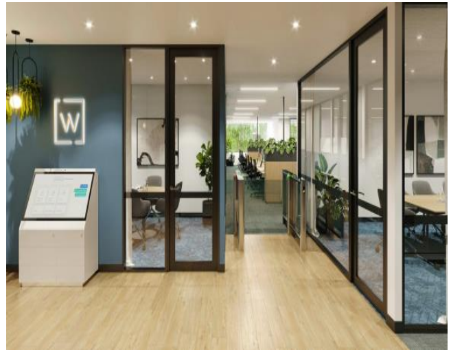
Waterman Workspaces concept at Blackburn Square.