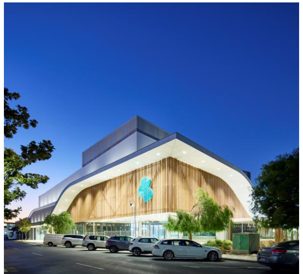
Busseton Central, Busseton WA