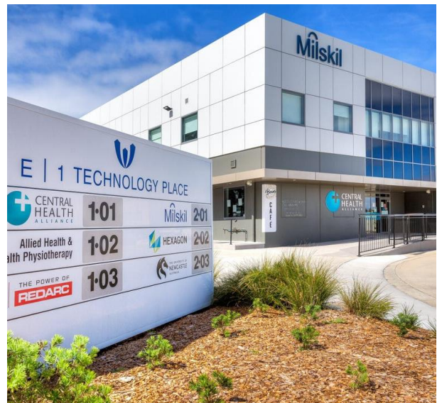
Williamstown Aerospace Centre, Williamstown NSW