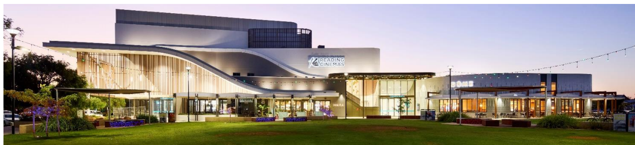
Busselton Central, Busselton WA

Note: Distributions and performance are not guaranteed, and past performance is not necessarily an indicator of future performance. Longer term performance assumes distributions reinvested. Distributions may include a capital component. Refer Important Information page.