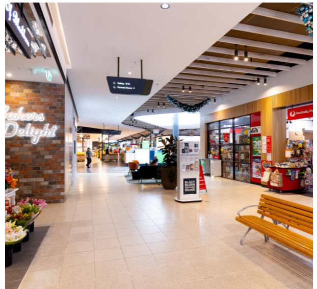
Blackburn Square, Blackburn VIC